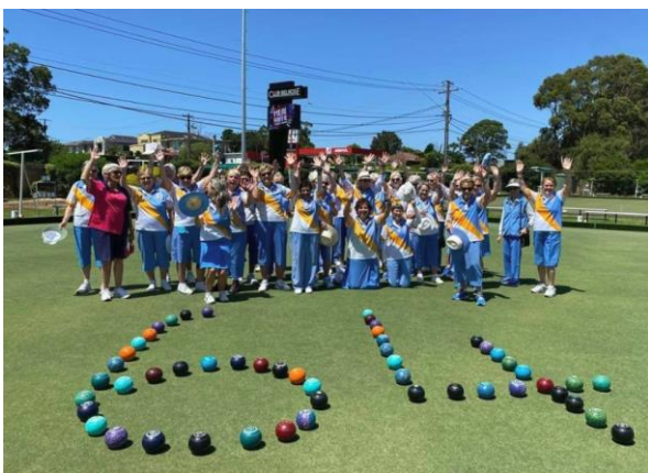
Group Photo for 2023