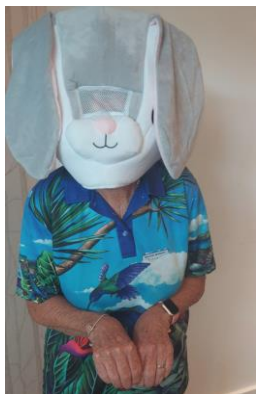
"The Easter Bunny" making an unexpected visit to Club Belrose